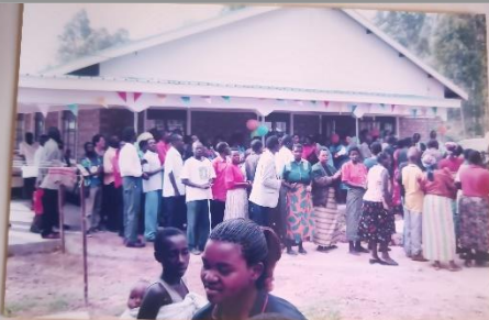
The staff prayed for funds to complete it. Donations were received from friends and well-wishers abroad. Then the Lions Clubs International confirmed their support to enable its completion.