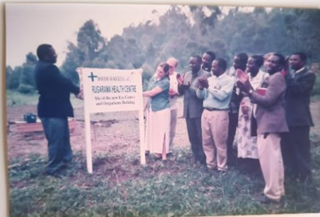
It was witnessed by the Management Committee & representatives from the donors, Truro Episcopal Church USA.

three issues until the end of the year we will be sharing beautiful testimonies and stories of our history.